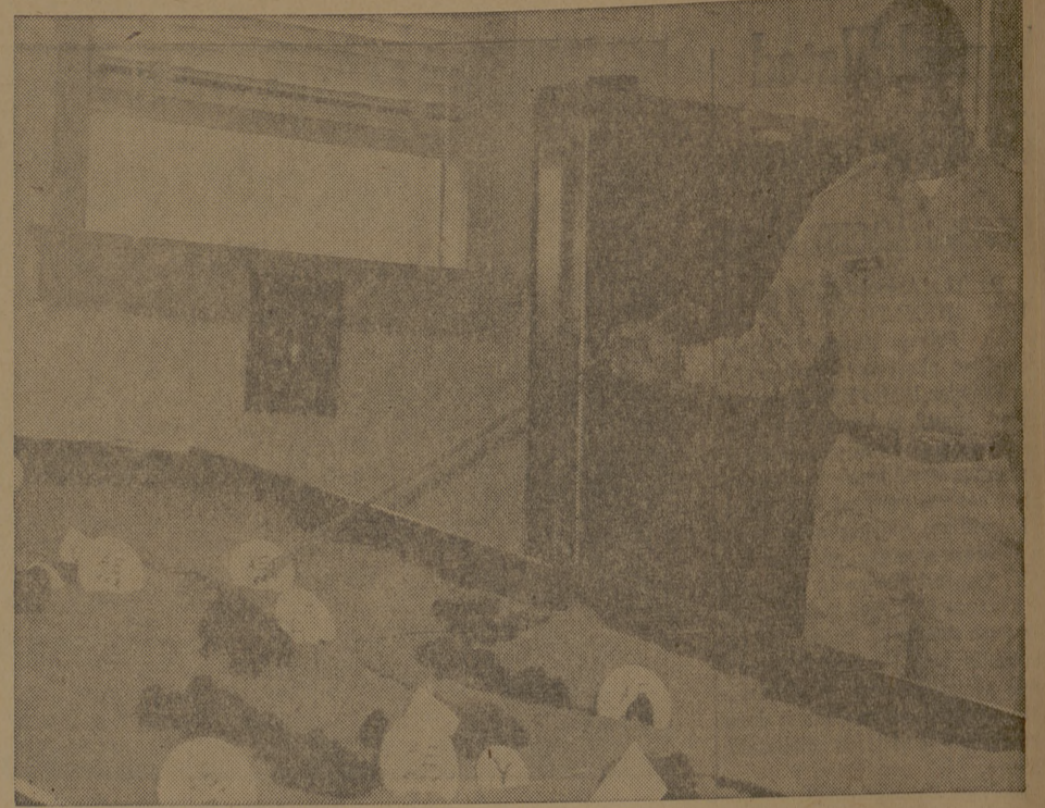
"The Blue Room"