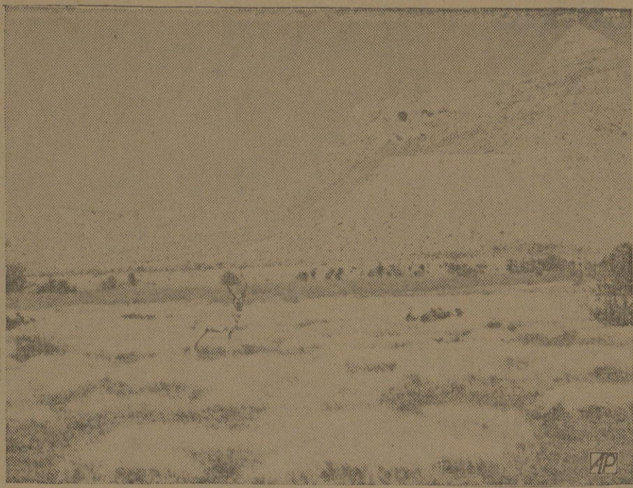
Makings Of Fine Trophy