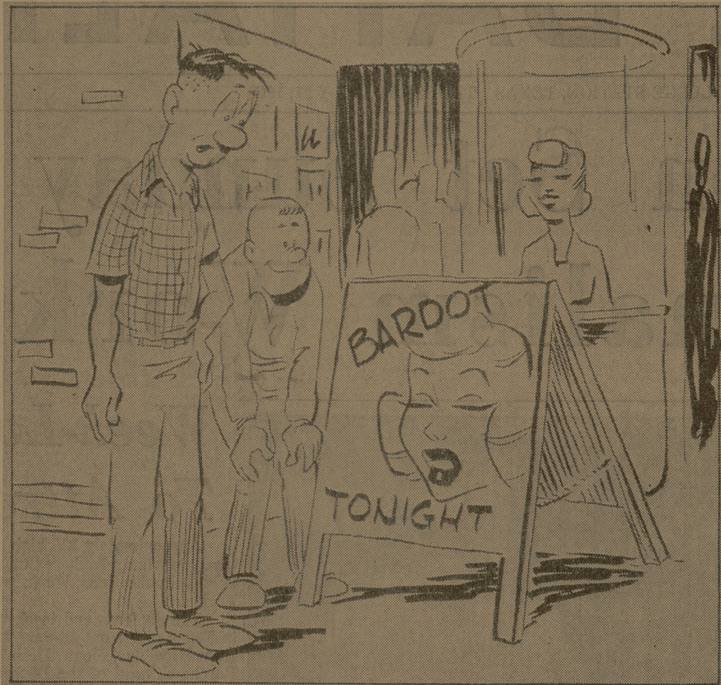
"You're right! Maybe a movie would relax me so I wouldn't be so nervous in th' quiz tomorrow morning!"