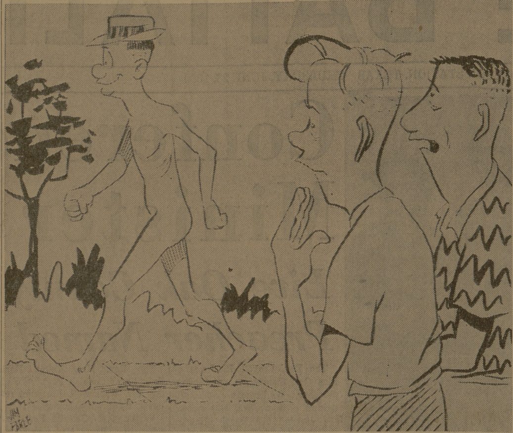
"... Guess there's more than one way to beat th' heat!"