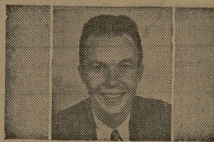
State Farm Saved Texans Money