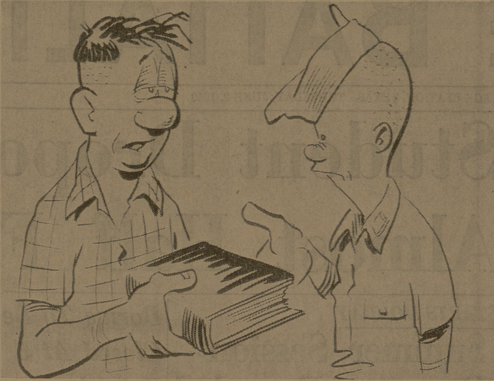
"... I'm afraid I can't sell you my text this semester. Maybe after next semester?"