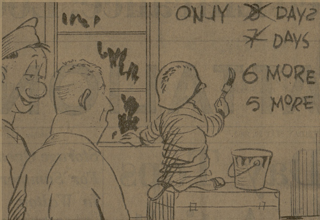
"... he's sorta anxious to be a sophomore."