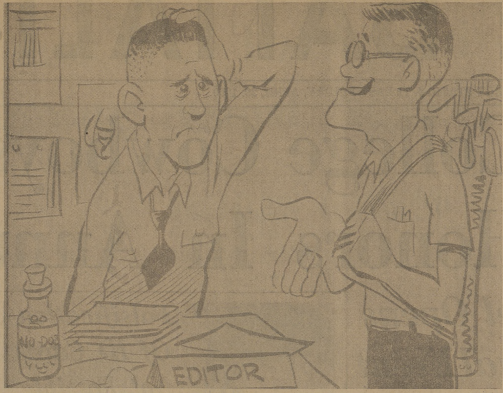
... th' best thing about bein' 'Battalion' editor is that it feels so good when you quit!