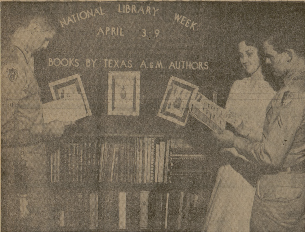
Books by A&M Authors