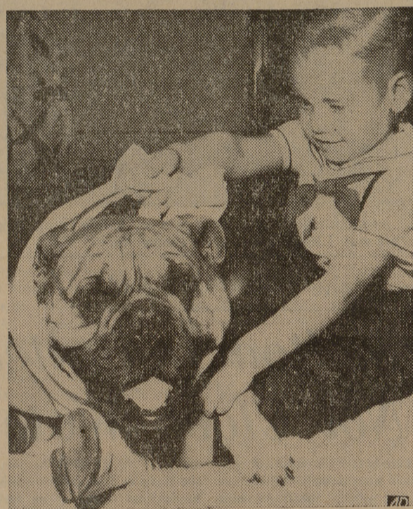
Let's Face It: Mumps