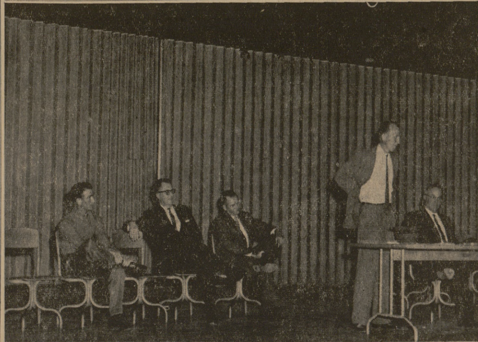
Consolidated School Board Rally