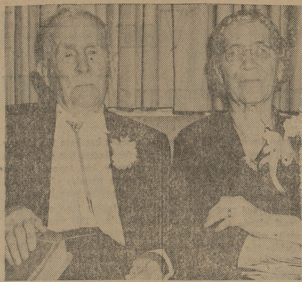
A Living Legend

The assistant professor has been with A&M since 1948, having his undergraduate work at the University of Pittsburgh. He studied for 18 months at the North Carolina State College in the field of nuclear physics. He is recognized as an authority in the field of power generation.