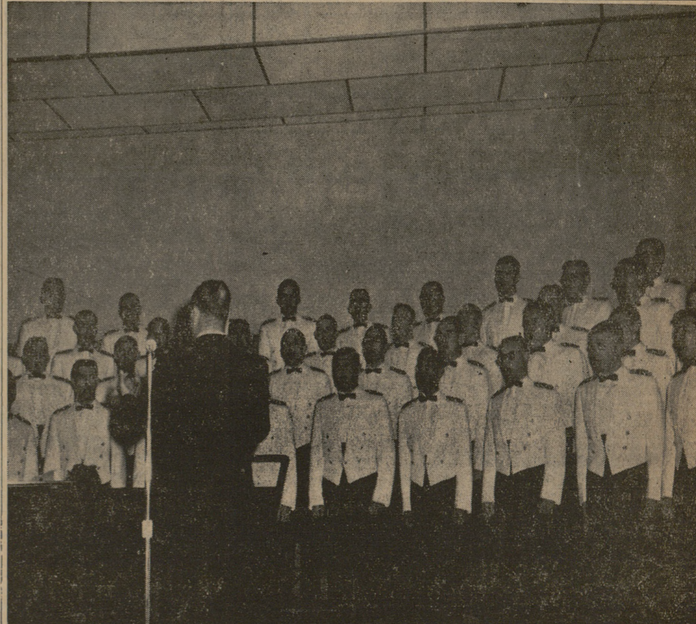
New Apparel for Singing Cadets

Since that time, all counselling and testing of incoming students has been done by the Basic Division.