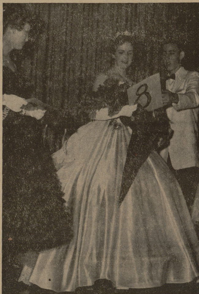
FFA Sweetheart Crowned

The Finance Committee is beginning work toward getting out dues letters to student members. The dues will be $1 per semester and will be used in correspondence and financing the programs of the chamber.