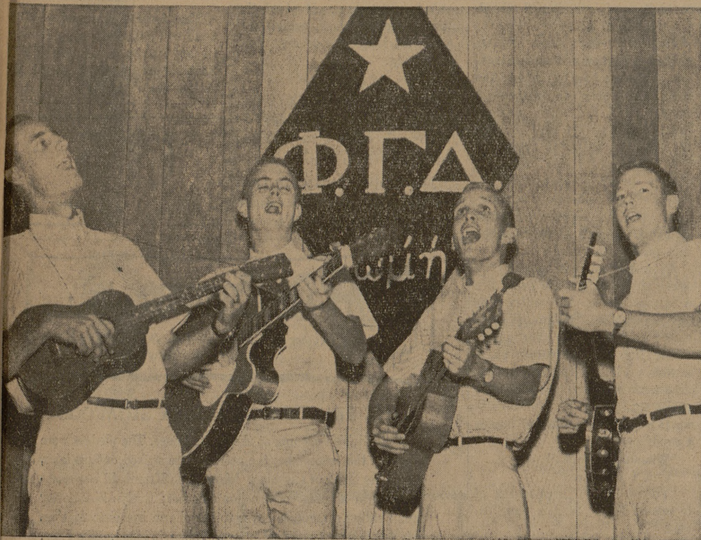
The Suvans from Texas Tech... quartet singing folksongs