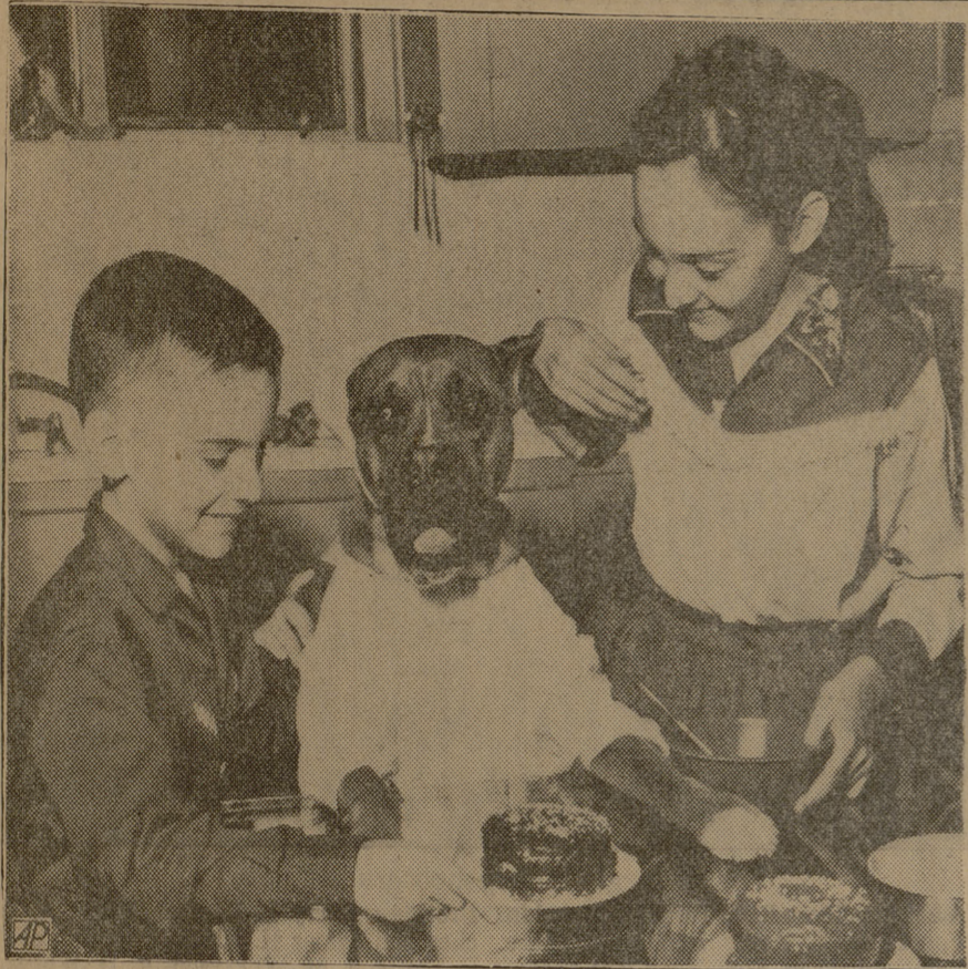
Double Attention For Mozart's Birthday