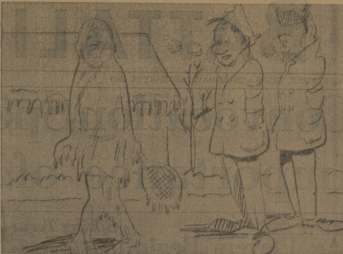
"This cold spell hit kinda sudden!"

Eisenhower's schedule in Brasilia included a civic reception in the center of the city, the unveiling of a monument commemorating his visit, dedication of the foundation stone for the new U. S. Embassy, and a dinner he will give tonight for Kubitschek.