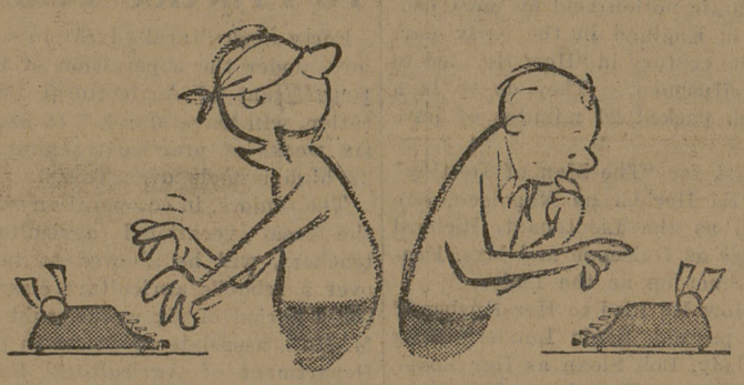
Touch system or hunt-and-peck—Results are perfect with

The Soil Conservation Service, U. S. Department of Agriculture, will interview agricultural and civil engineering, agricultural education, animal husbandry, agronomy, range and forestry degree candidates for positions as soil scientists, range conservationists, soil conservationists and engineers.