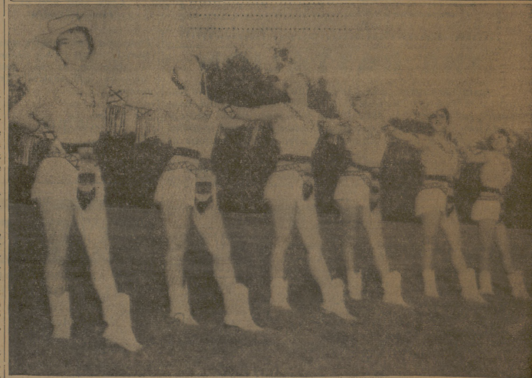
Famed Precision Drill Team