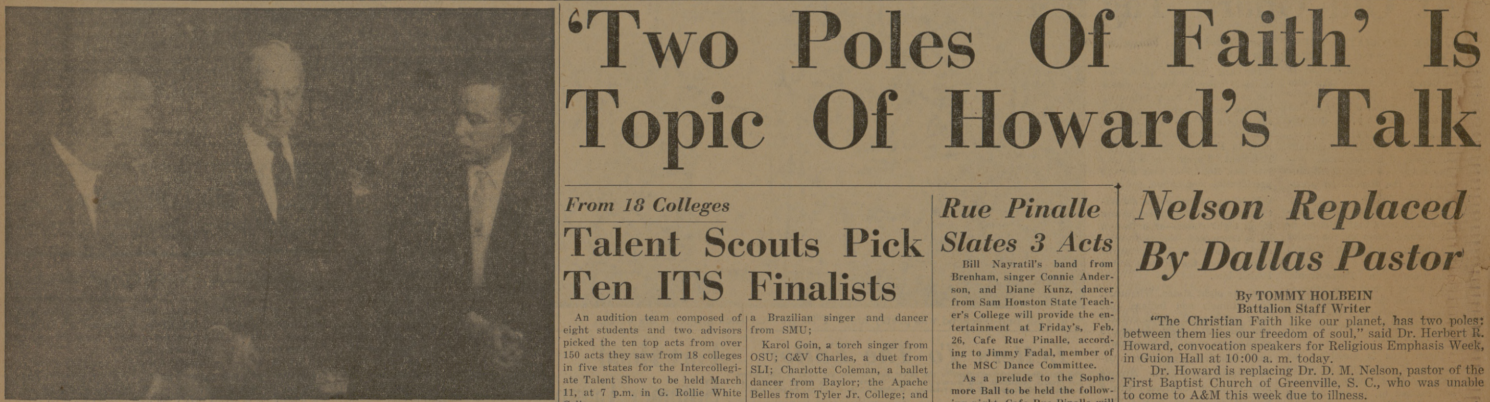
Founder and Students

agricultural economics and rural sociology department in 1919. Forty-one years have passed since this relatively new phase of agricultural training was added at the college, making A&M a pioneer in this field four-year scholarship. with the fourth largest department in the