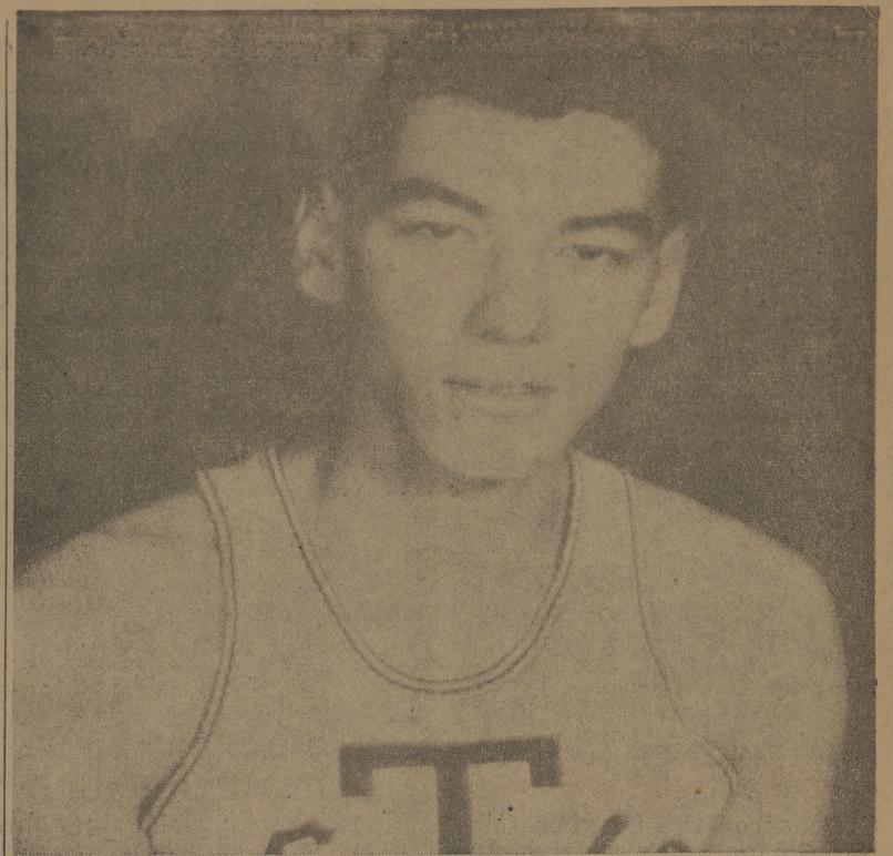
High Scoring Cadet

Class A cross country was scheduled before the midterm break but had to be cancelled twice because of rain. Welch said that a date for the meet would be set later in the spring.