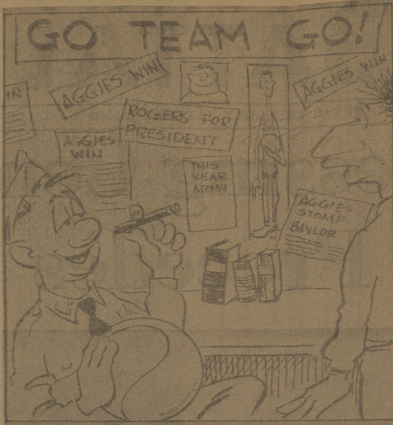
"... Yes, I guess you could say I've become somewhat interested in basketball!"