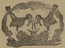
It takes two to fill the bill

A little good humor and gallantry on the road may save a life and even if it doesn't it will be appreciated by other drivers. Courtesy is contagious.