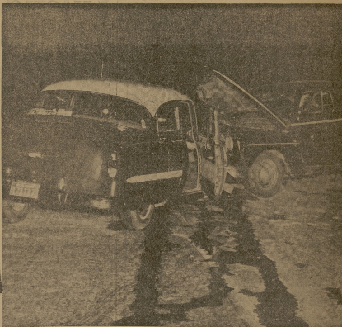
One More for the Long, Lonesome Road...

The Texas Department of Public Safety has officially predicted that 111 Texans will be killed in Christmas-New Year's holiday traffic this year.