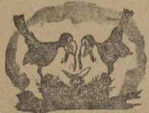
It takes two to fill the bill

He is active in church, civic and community affairs and resides with his family at 108 Poplar Street.