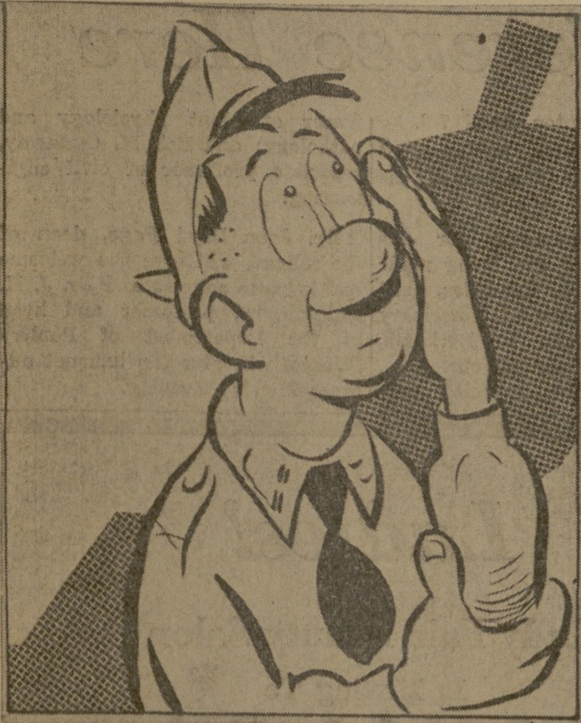
HAVE CHRISTMAS GIFT PROBLEMS?