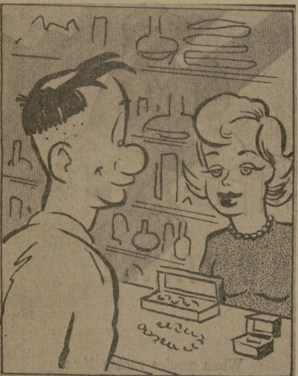
THE MEMORIAL STUDENT CENTER GIFT SHOP WILL GIVE YOU PERSONAL HELP IN SELECTING A GIFT FOR ANY BUDGET.