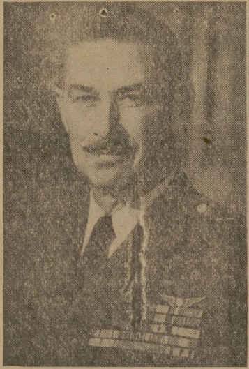
Gen. John B. Medaris

General Medaris is the commander of the Army Ordnance Missile Command and chief of the United States' Space Program. He holds the Legion of Merit with Oak Leaf Cluster and has successfully completed the development of the Redstone and Jupiter Missile Systems.