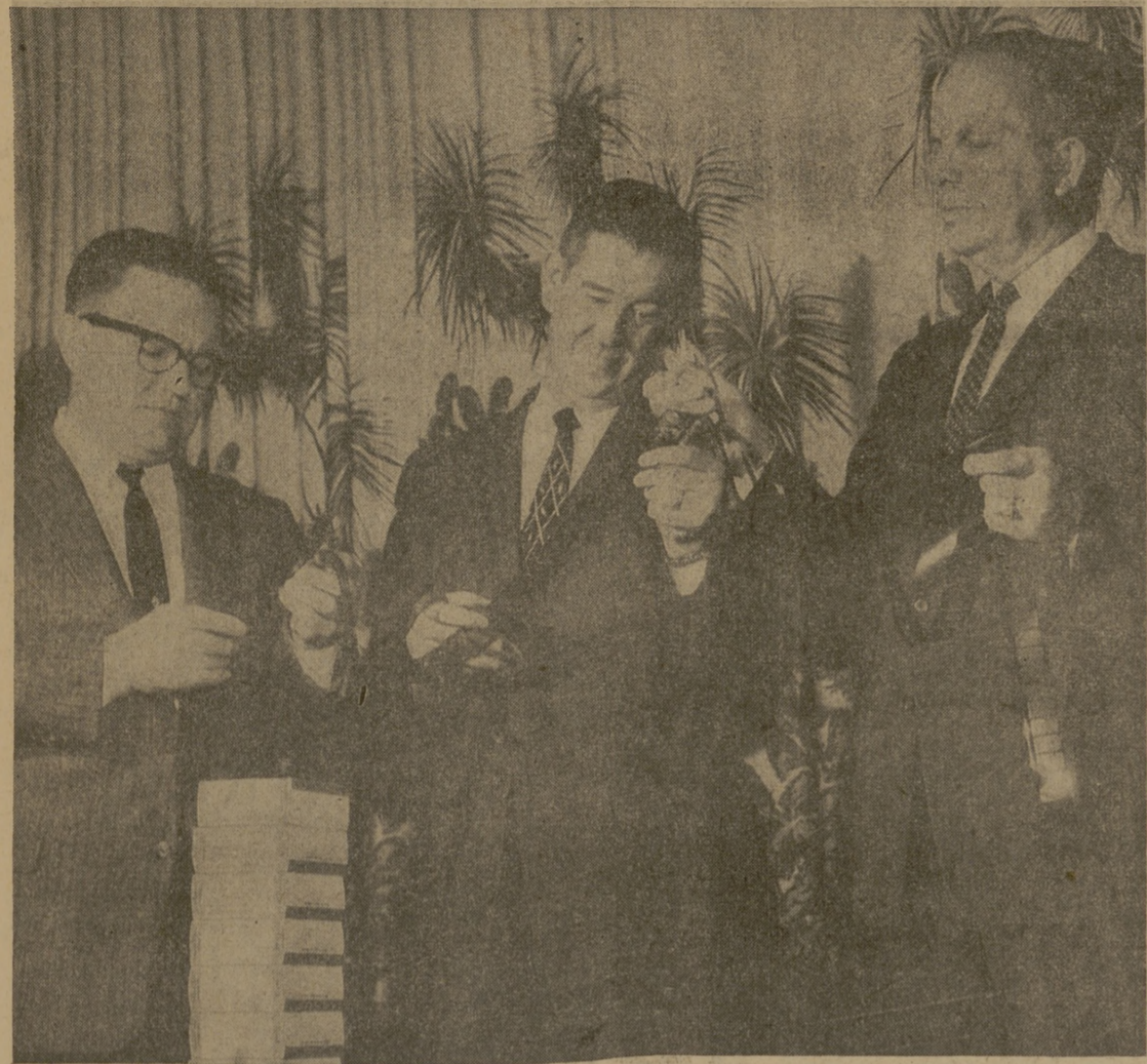
Sears Microfilm Received