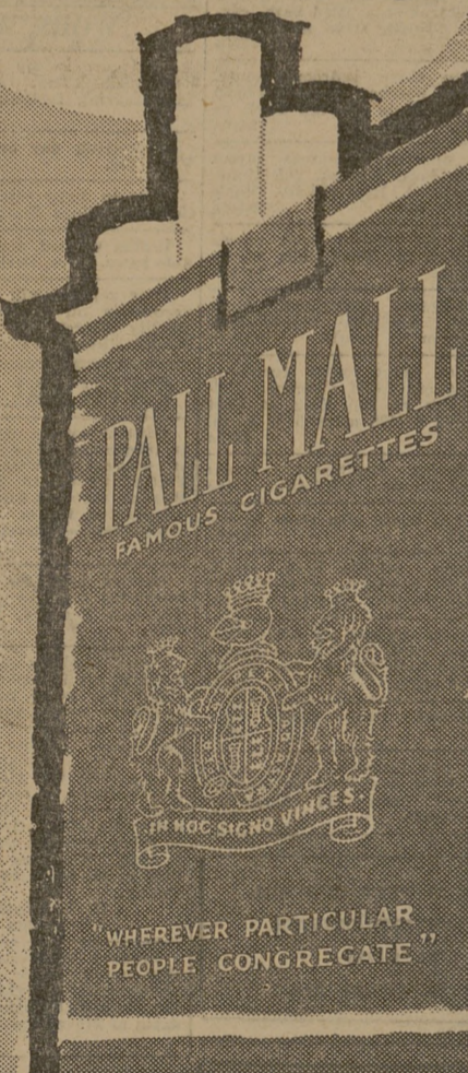
You can light either end!

Get satisfying flavor...so friendly to your taste!