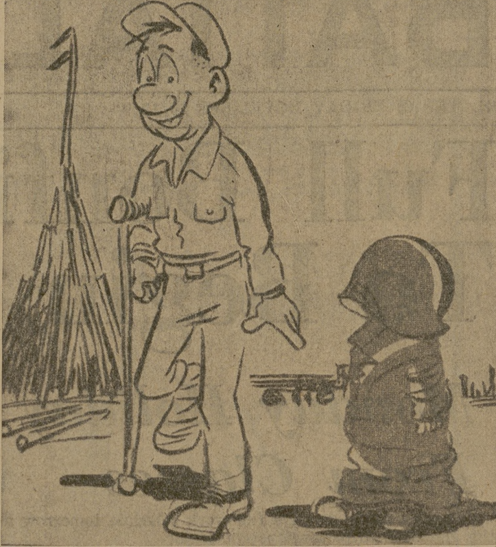
"I wonder if those guys in class realize how safe and secure they are?"

What's Cooking Industrial Education Wives Club will meet Monday night at 7:30 in Room 203 of the YMCA.