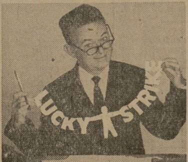
Dr. Frood, Ph.T.T.

Dear Dr. Frood: I read a great deal so I never have time for girls. Am I missing anything? Literate