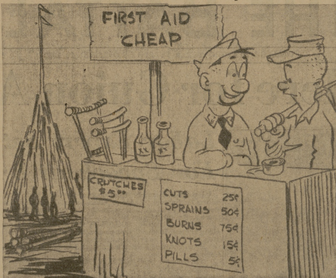
"It's A Good Business—But Strictly Seasonal!"

Antwerp, situated 55 miles up the Schelde River in Belgium, is one of the world's busiest sea-ports.