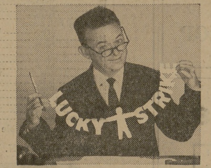
Dr. Frood, Ph.T.T.

DR. FROOD'S MORAL OF THE MONTH When the world seems dark . . . when the sun refuses to shine, do not fret. It happens every night.