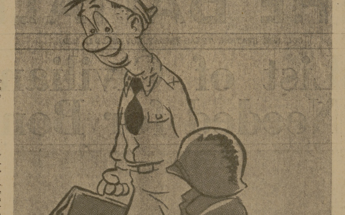
"Whad'ya say we don't come back from Houston until after they build the bonfire?"

WEDNESDAY NOVEMBER 18 8:30 A. M. — 1 P. M.