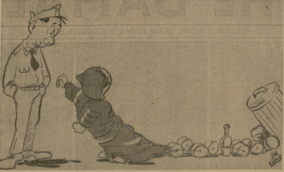
"Don't just stand there-untangle my spurs!"