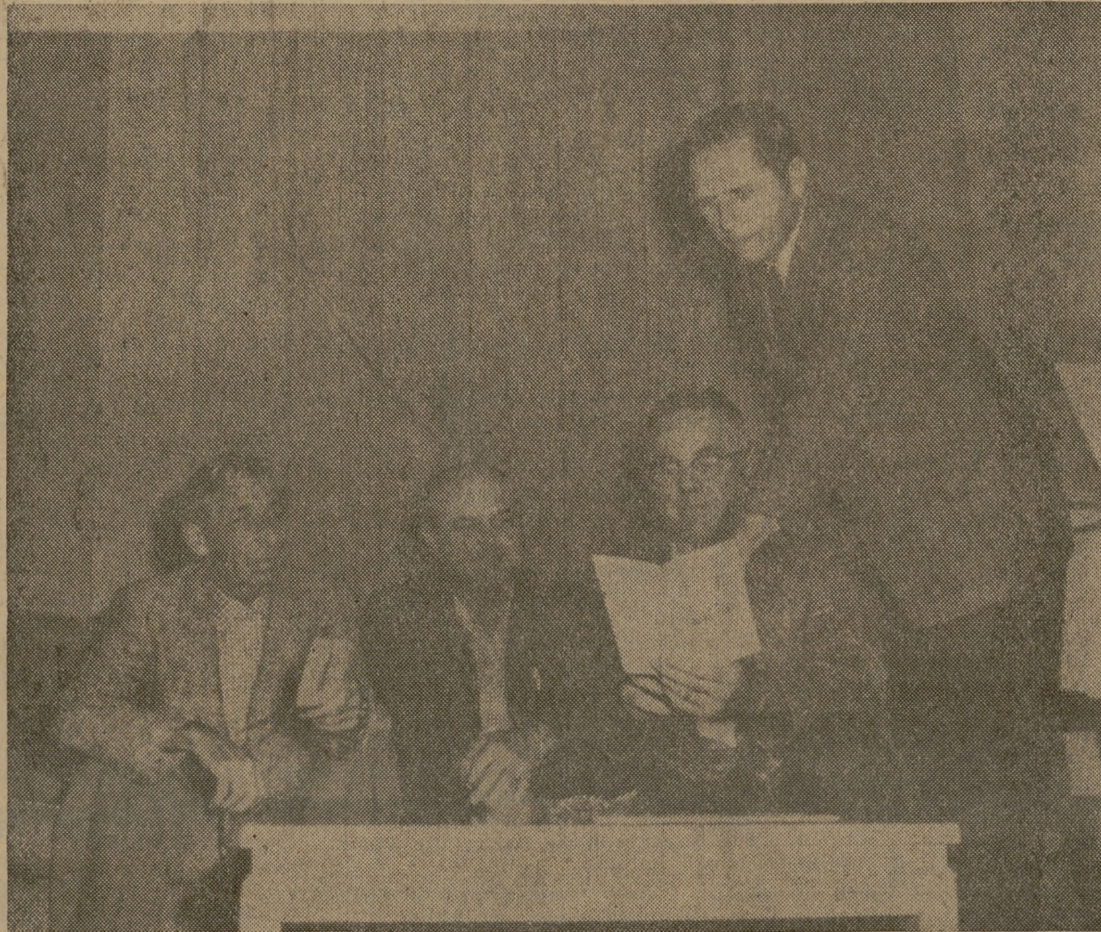
United Chest Officials