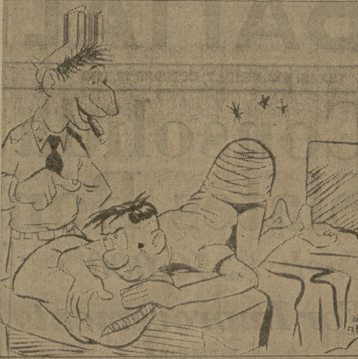
I've seen plenty of rodeos, but I've never seen anyone ride like you did last weekend.