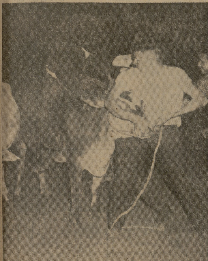
... and more action!!