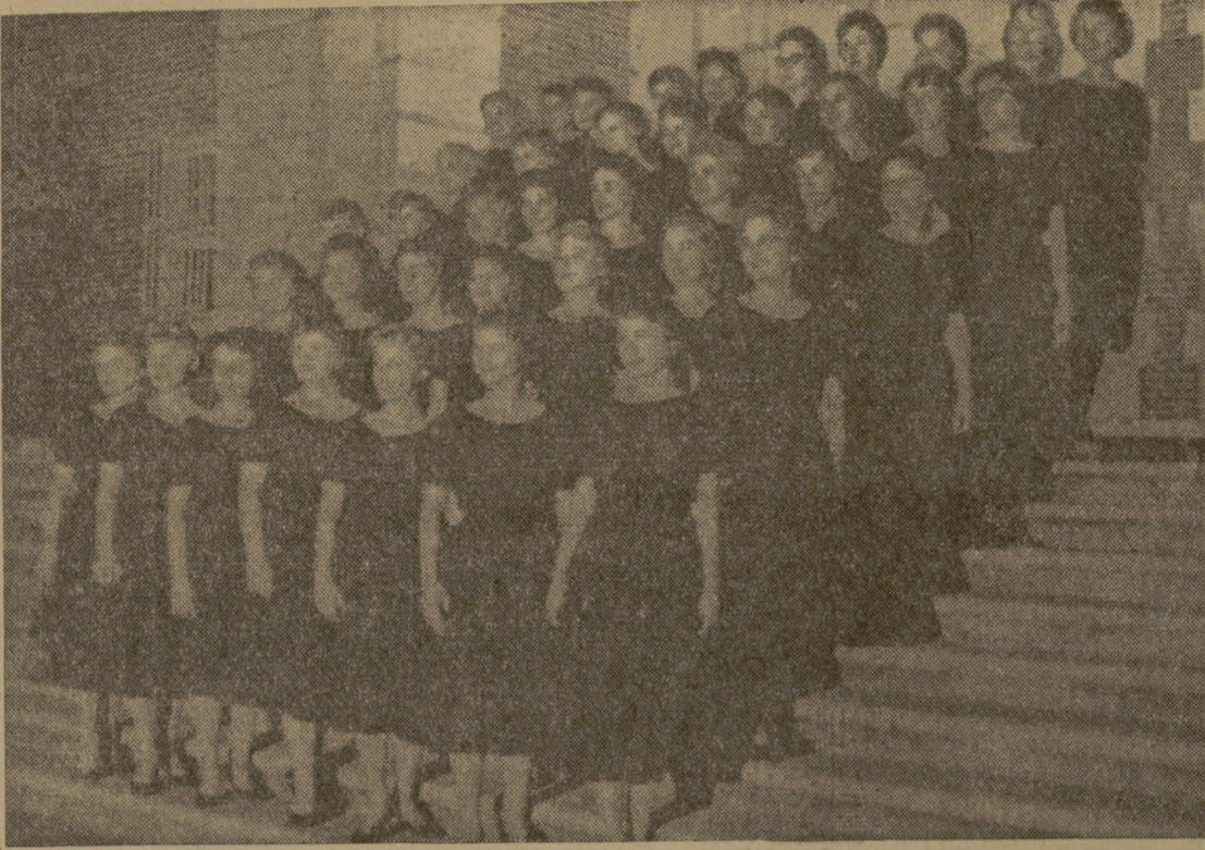
The TWU Modern Choir . . . to make Aggeland appearance