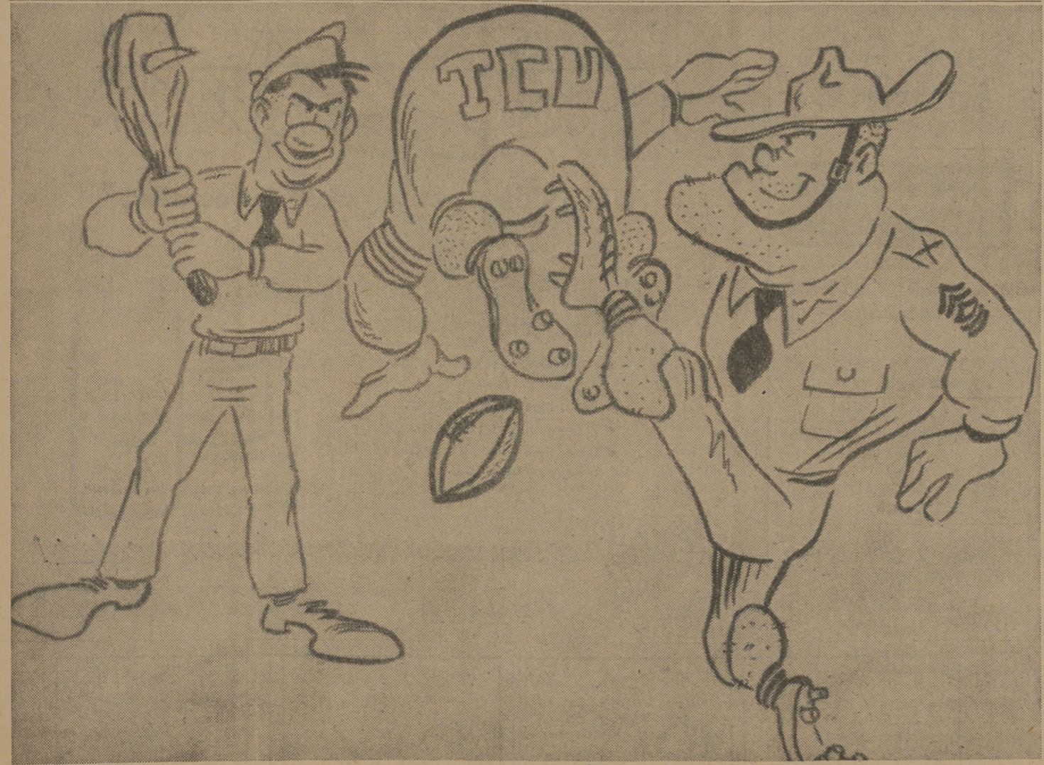
TCU Next for Slouch, Ole' Sarge ... lead Aggies in search of fourth straight win