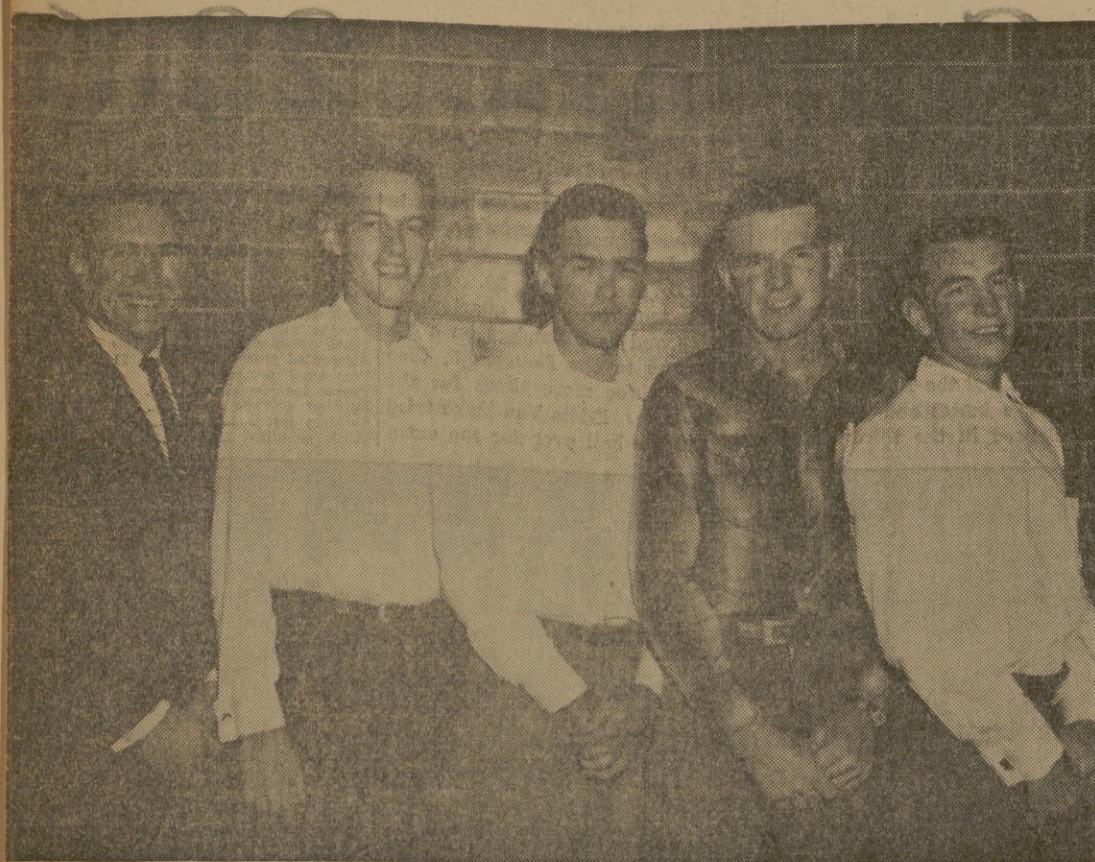
Kansas City Board

The giant oil industry has over 2000 job classifications, with above average pay, opportunities for advancement, and security. Don't wait for job interviews, INITIATIVE gets the job! Send for our combined list of the large oil companies, service companies, suppliers, and drilling contractors, complete with main office addresses. Over 75% of the new employees in the Southwest's oil industry will be hired by companies on our list. For opportunities in OIL, send $1 to: Oil Employment Information, Box 4603, Midland, Texas