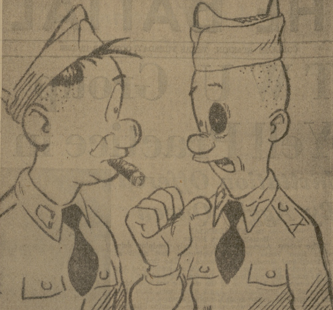
"They told me it was an Aggie Tradition to kiss girls after touchdowns—so I grabbed this senior's date and kissed her!"