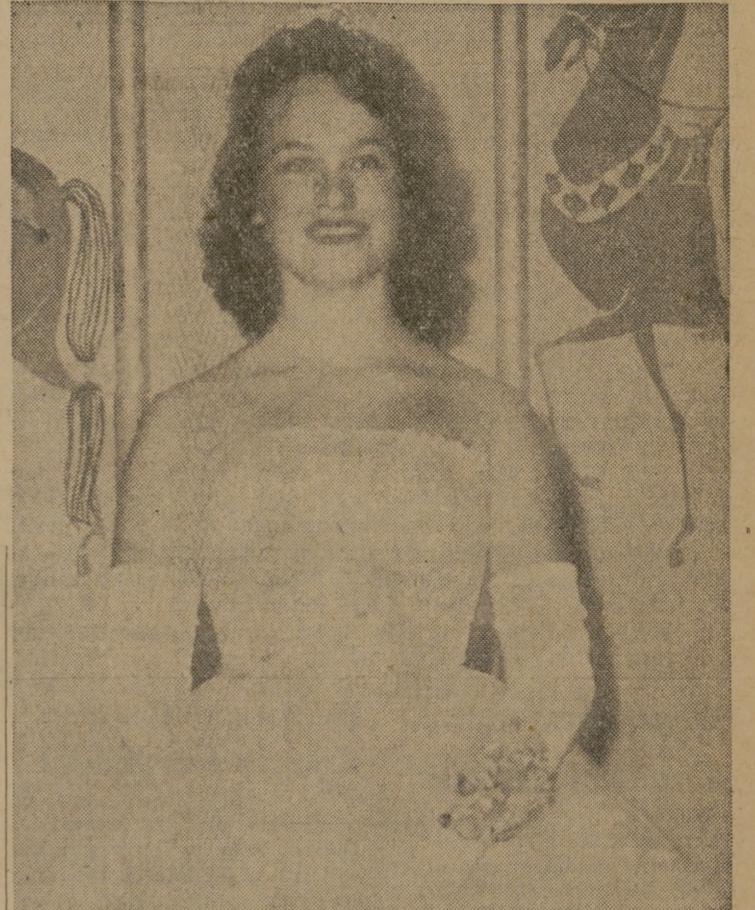
Featured Vocalist Tonight