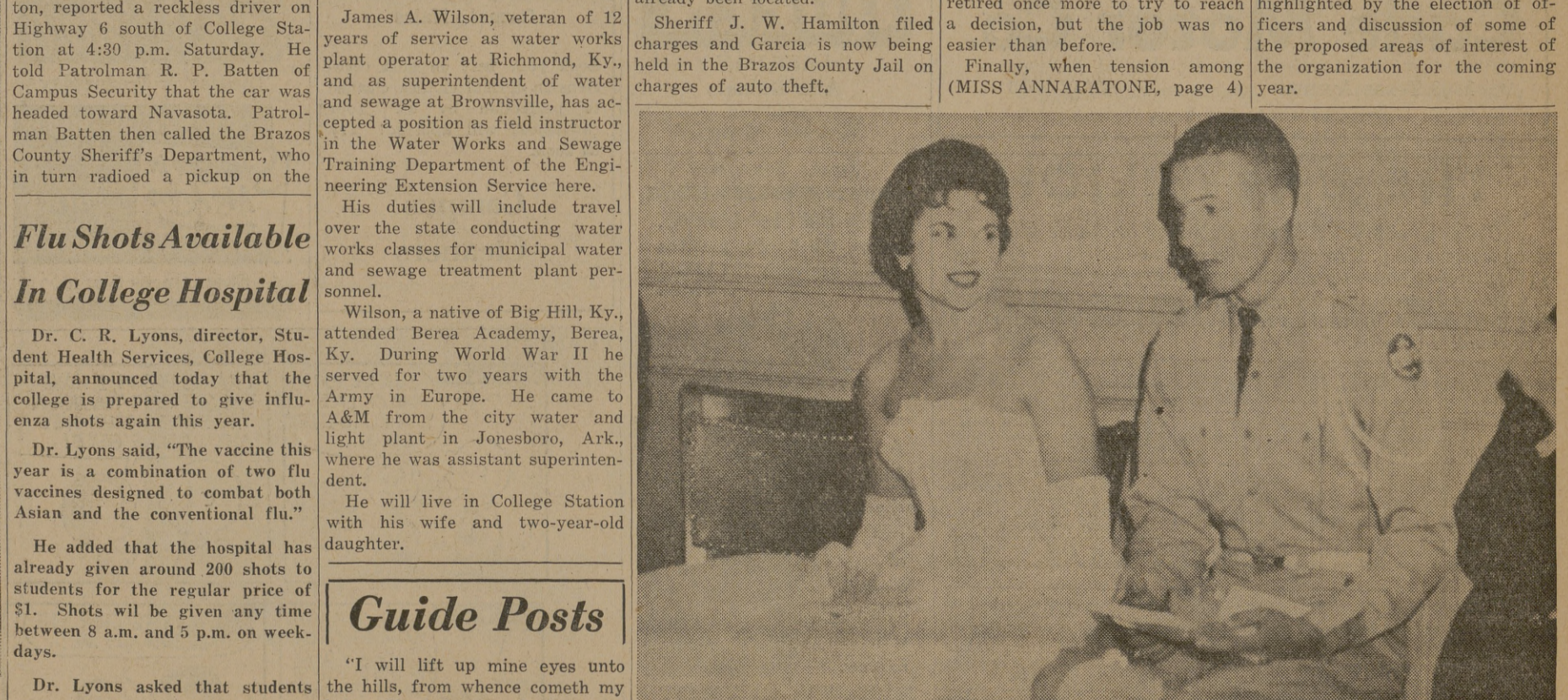
The Smile That Won

last night in the Social Room of ment only to find that the car had After breakfast, the committee the Memorial Student Center,