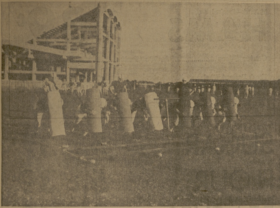
Ags Hit the Dummy Course

Fundamentals are taught continuously on an athlete to peak condition than a hundred Kyle Field. A sharp session with the blocking dummies can do more towards building linemen can take their turns on this unit.