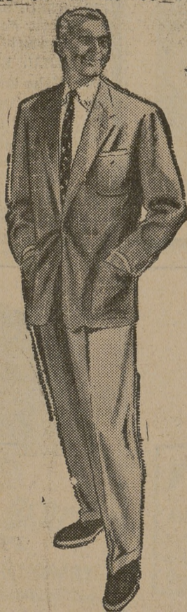
Fabric by Forstmann Sport Coats by Michaels-Stern