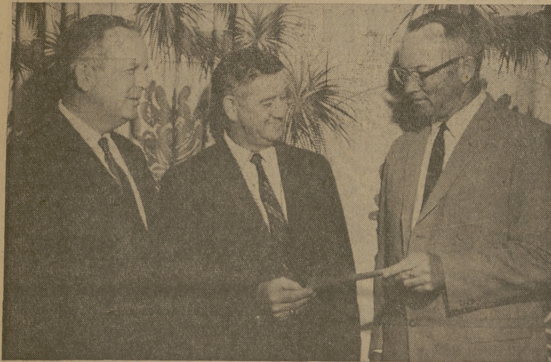
Money for Scholarships