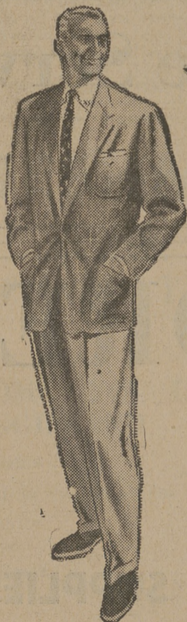
Fabric by Forstmann Sport Coats by Michaels-Stern