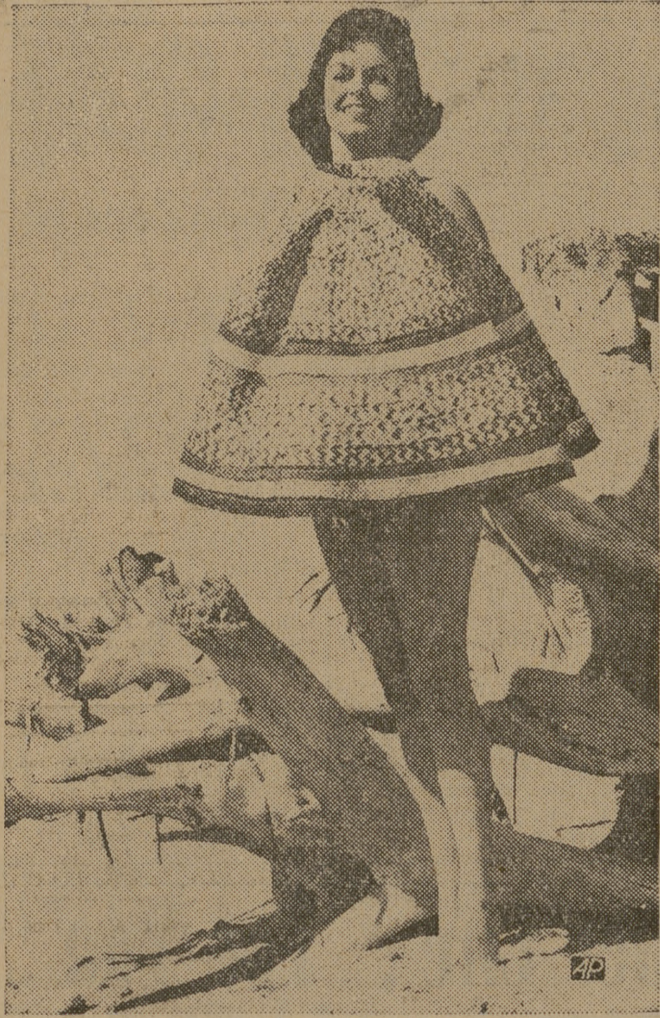
Enjoying Padre Island

Mexican hats are useful in many ways, finds Rose Marie Bebee of Port Isabel. She is using hers to shield herself from the hot summer sun on South Padre Island, playground of the semi-tropical Lower Rio Grande Valley of Texas which is being boomed for a national park.