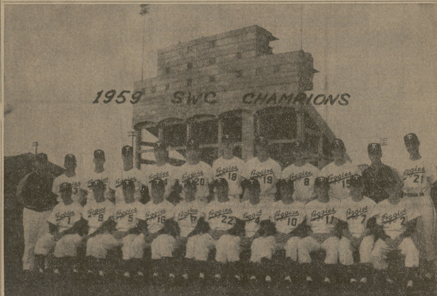
1959 SWC Baseball Champions

... face Arizona in NCAA Region 5 playoffs, see story Page 5