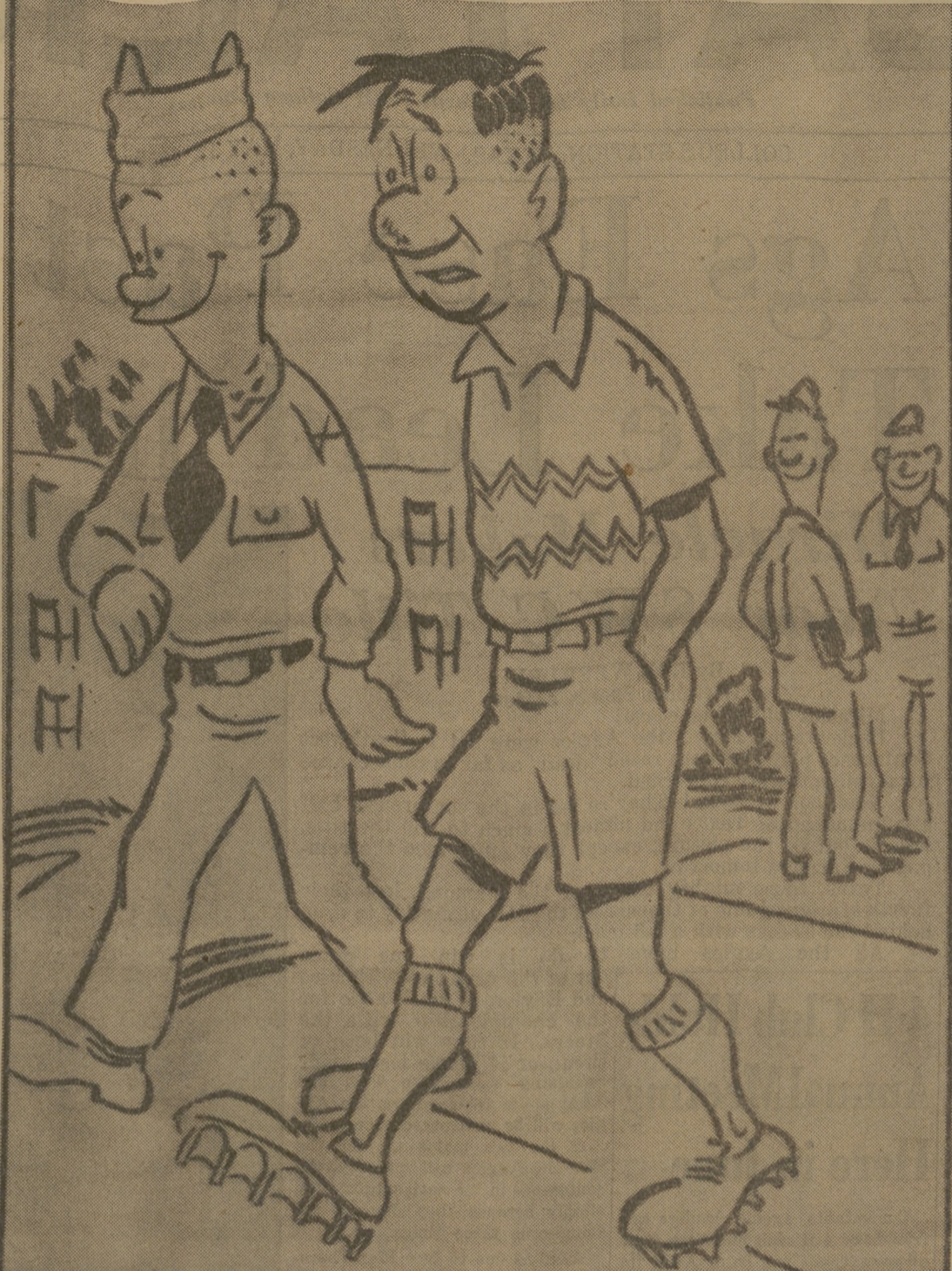
"For some reason I have an intense feeling of insecurity!"

Lloyd and Couve de Murville took a similar line.