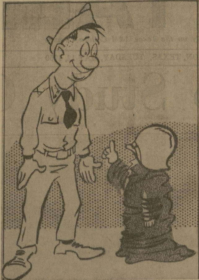
"... Th' high jump! Of all the intramural track events, they entered me in th' high jump!"