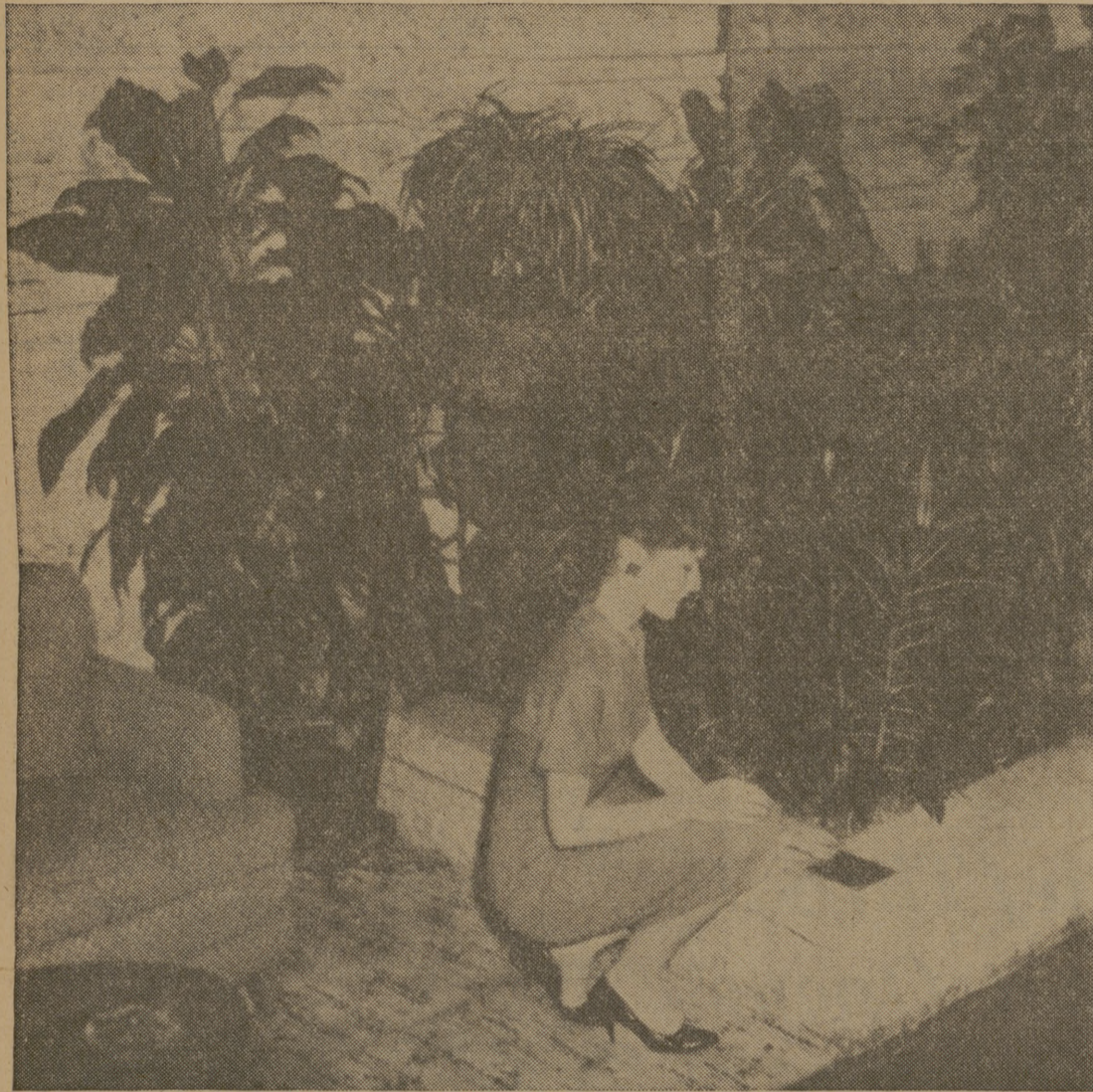
For the MSC

This planter-fountain will be presented to the Memorial Student Center Parents' Day at 2:30 p. m. by the Austin A&M Mothers Club. The fountain is in memory of the