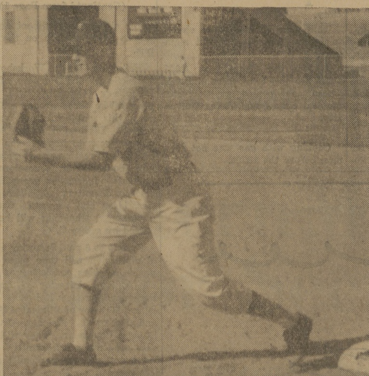
The Long Stretch

There are 500 active volcanoes in the world.